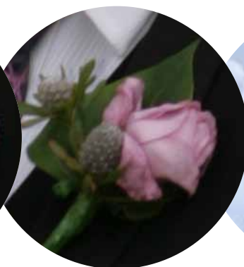
During the wedding