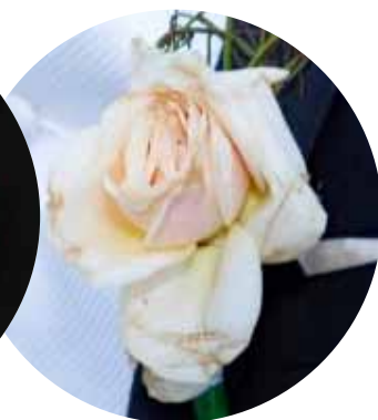
Not so nice